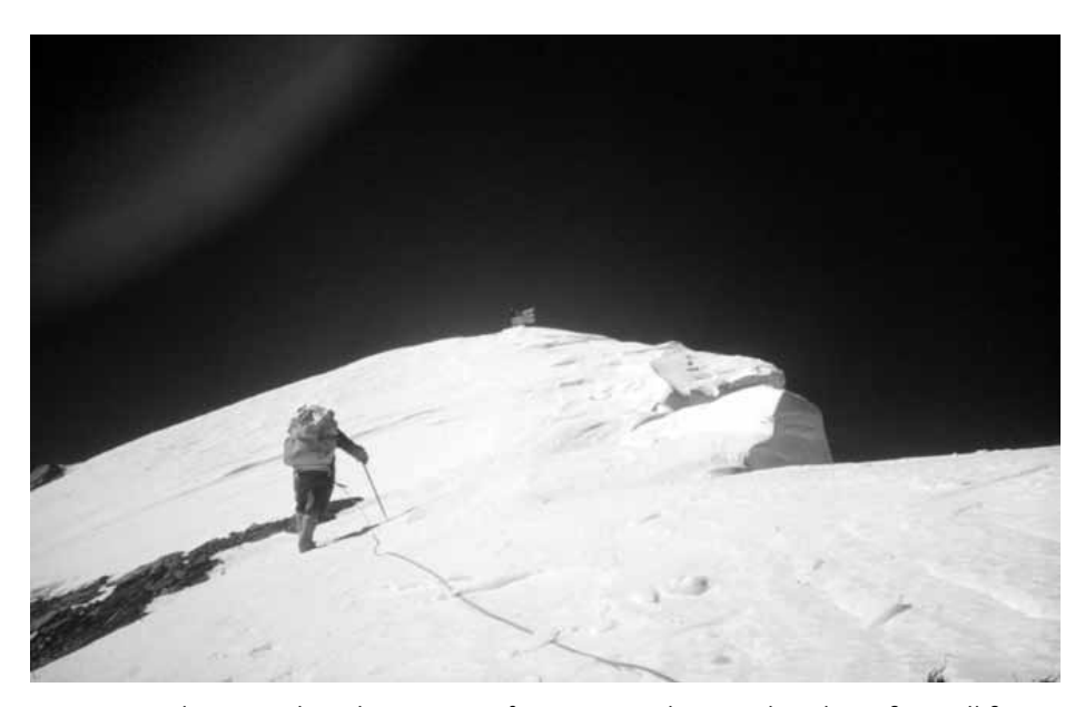
Lute Jerstad approaches the summit of Everest, with Jim Whittaker's flag still flying, May 22, 1963.

Jerstad and Bishop were not waiting for them; they had arrived nearly