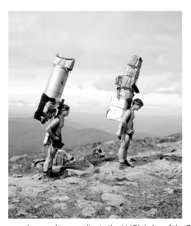
Young hut crew members packing supplies to the AMC's Lakes of the Clouds hut on Mount Washington, 1969.

Many young Americans, exposed to the barrage of Everest publicity, decided that they wanted to become mountaineers too. In one measure of the newfound popularity of climbing (or at least dressing like a climber), Jim Whittaker's employer, Recreational Equipment Incorporated (REI), increased its membership from 50,000 in 1965 to 250,000 in 1972. A rival